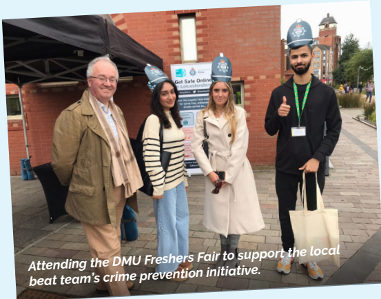
Attending the DMU Freshers Fair to support the local beat team's crime prevention initiative.