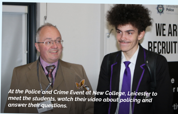
At the Police and Crime Event at New College, Leicester to meet the students, watch their video about policing and answer their questions.