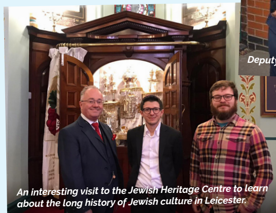
An interesting visit to the Jewish Heritage Centre to learn about the long history of Jewish culture in Leicester.