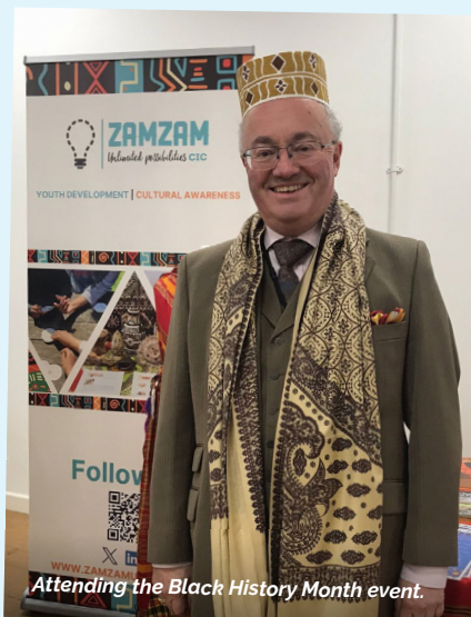
Attending the Black History Month event.