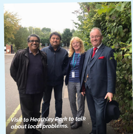
Visit to Heathley Park to talk about local problems.