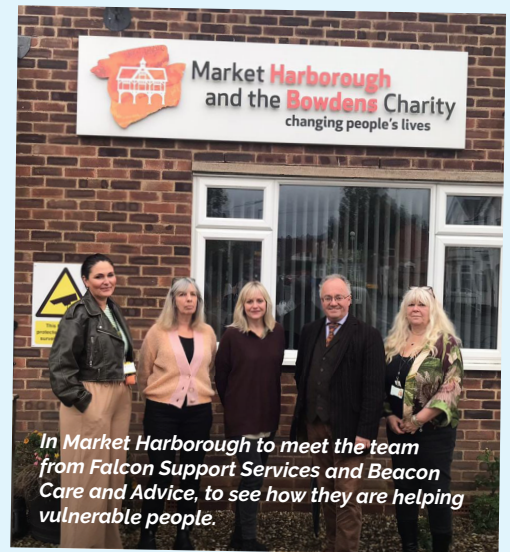
In Market Harborough to meet the team from Falcon Support Services and Beacon Care and Advice, to see how they are helping vulnerable people.