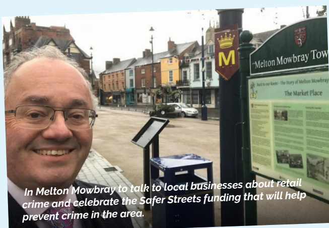
In Melton Mowbray to talk to local businesses about retail crime and celebrate the Safer Streets funding that will help prevent crime in the area.