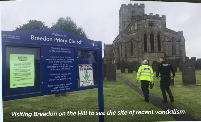
Visiting Brendon on the Hill to see the site of recent vandalism.