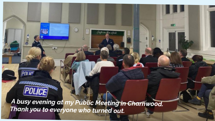
A busy evening at my Public Meeting in Charnwood. Thank you to everyone who turned out.