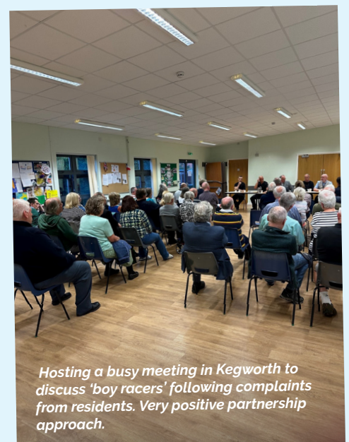
Hosting a busy meeting in Kegworth to discuss 'boy racers' following complaints from residents. Very positive partnership approach.