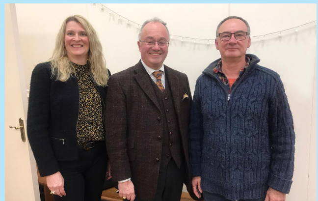
At Sheepy Magna Parish Council's public meeting for a Q&A