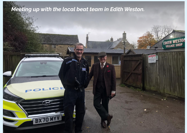
Meeting up with the local beat team in Edith Weston.