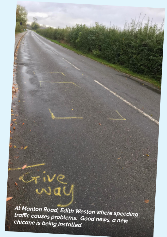
At Manton Road, Edith Weston where speeding traffic causes problems. Good news, a new chicane is being installed.