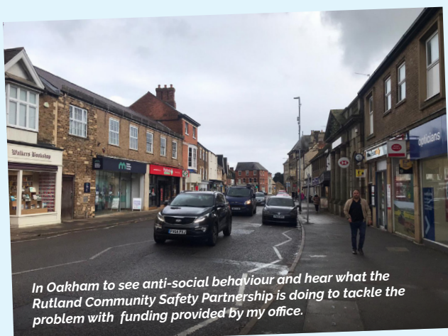
In Oakham to see anti-social behaviour and hear what the Rutland Community Safety Partnership is doing to tackle the problem with funding provided by my office.