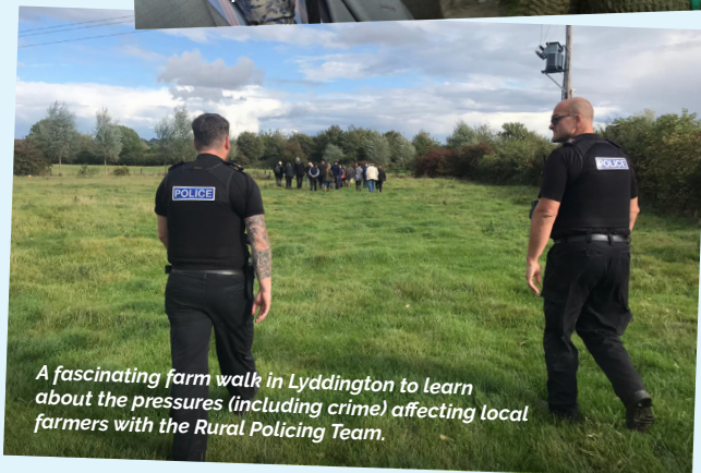
A fascinating farm walk in Lyddington to learn about the pressures (including crime) affecting local farmers with the Rural Policing Team.