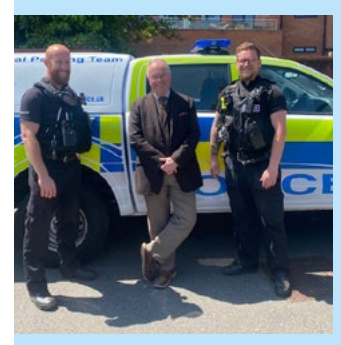
Rural Policing Team recover £1,000,000. See page 4