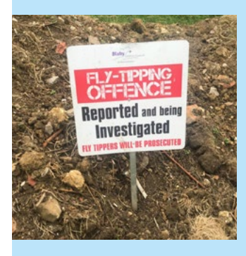
Tough action on fly tipping. See page 3