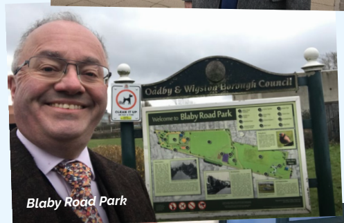
Blaby Road Park